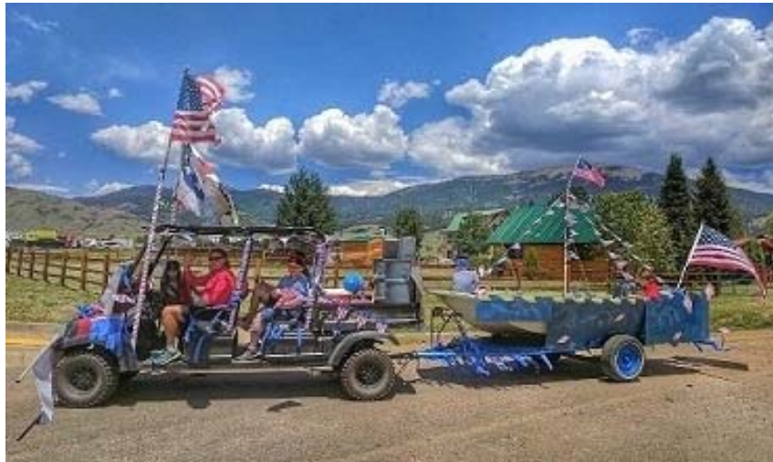
Honoring the theme of celebrating the 100th anniversary of Eagle Nest Dam, Idlewild's "Boat Float" was designed, decorated, and entered for competition in the 4th of July Eagle Nest Parade